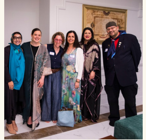
Shoulder to Shoulder Campaign's Annual DC Area Iftar